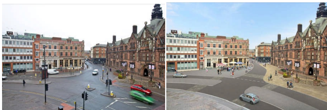
Coventry High St with signals

Exhibition Road in London is now “shared space”, though drivers still assume priority in the time-honoured fashion dictated by traffic controls. Also it remains plagued by traffic lights at both ends and forever beyond. Britannia junction in Camden is getting a makeover but retaining signals. The DfT has published an advice note, but it’s not policy, and there is a lack of vision about the wider potential of these ideas.