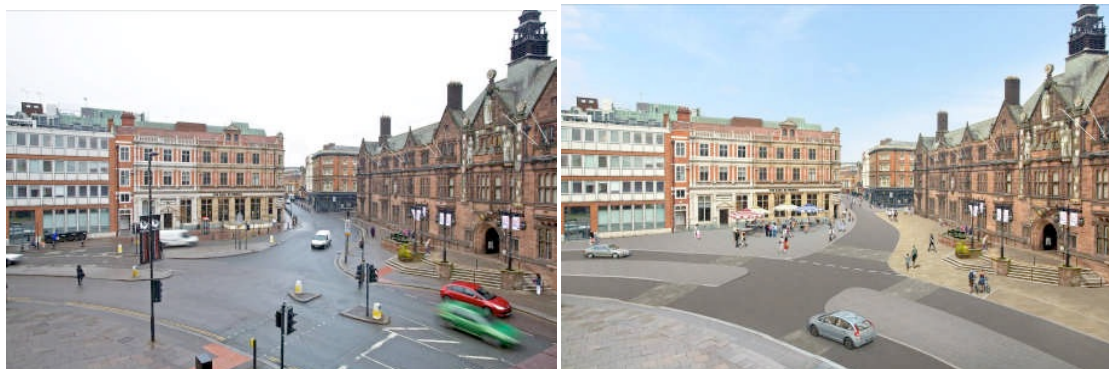
Coventry High St with signals

Exhibition Road in London is now “shared space”, though drivers still assume priority in the time-honoured fashion dictated by traffic control. Also it remains plagued by traffic lights at both ends and beyond. Britannia junction in Camden is getting a makeover but retaining signals. The DfT has published an advice note, but it’s not policy, and there is a lack of vision about the wider potential of these ideas.